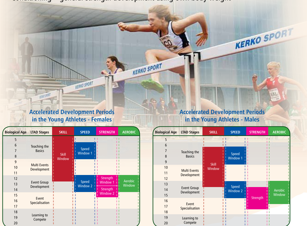
Diagram 2 – IAAF CECS Level II Coaching Theory